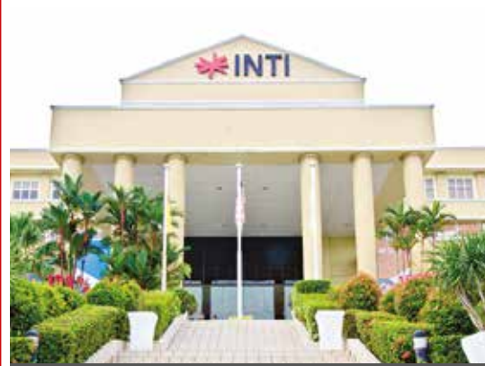
INTI INTERNATIONAL UNIVERSITY

PERAK 05-241 1933 | No. 258, Jalan Sultan Iskandar, 30000 Ipoh JOHOR 07-364 7537 | No. 25, 25-01, Jalan Austin Heights 8/1, Taman Austin Heights, 81100 Johor Bahru PAHANG 09-560 4657 | B16, Jalan Seri Kuantan 81, Kuantan Star City II, 25300 Kuantan SARAWAK 082-265 897 | Ground Floor SL.38. Lot 3257, Block 16, Gala City, Jalan Tun Jugah, 93350 Kuching