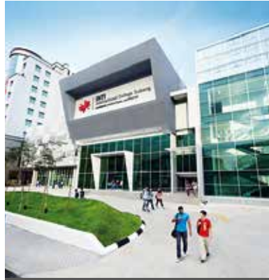
INTI INTERNATIONAL COLLEGE SUBANG