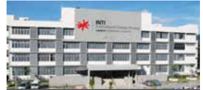
INTI INTERNATIONAL COLLEGE PENANG